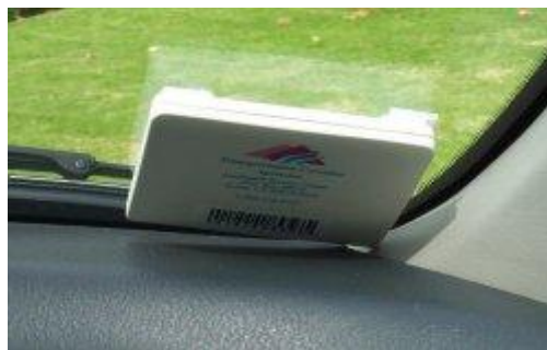
RFID enabled device

2. In 1946 Harry Stockman invented an espionage tool for the Soviet Union which retransmitted incident radio waves with audio information. Sound waves vibrated a diaphragm which slightly altered the shape of the resonator, which modulated the reflected radio frequency. Even though this device was a covert listening device, not an identification tag, it is considered to be a predecessor of RFID technology, because it was likewise passive, being energized and activated by electromagnetic waves from an outside source. Another early work exploring RFID is the landmark 1948 paper by Harry Stockman, titled "Communication by Means of Reflected Power". Stockman predicted that "... considerable research and development work has to be done before the remaining basic problems in reflected-power communication are solved, and before the field of useful applications is explored."